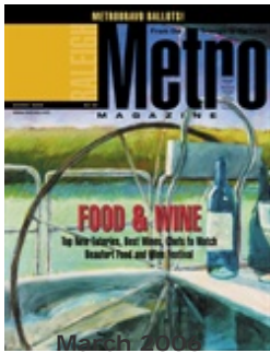
Food & Wine